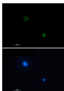
Immunofluorescent analysis of HL-60 cells using db12190 antibody (green), and DAPI (blue).